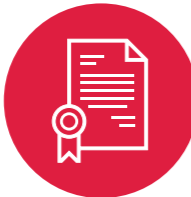
Years of experience